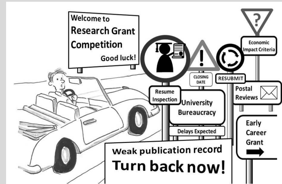
The research grant application process.

https://www.ifm.eng.cam.ac.uk/research/grant-writers-handbook/cartoons/