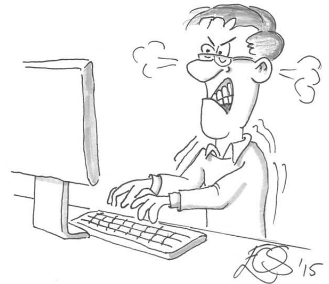
How not to respond to reviewers' comments.