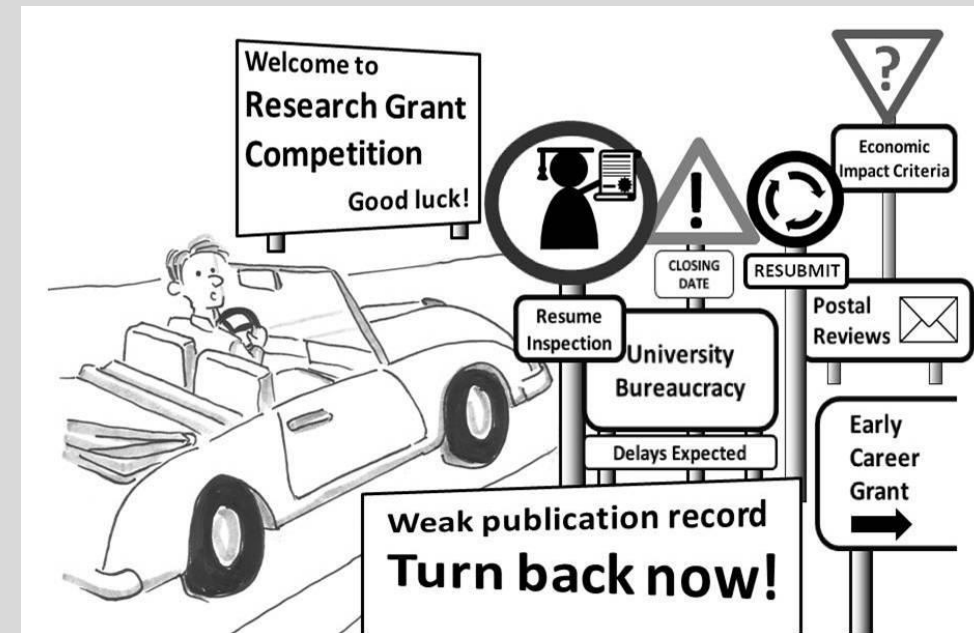
The research grant application process.

https://www.ifm.eng.cam.ac.uk/research/grant-writers-handbook/cartoons/