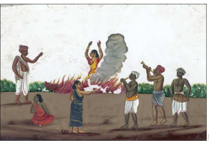
Suttee: An Indian widow burns on her husband's funeral pyre

The ars moriendi of the Middle Ages, in which dying people made their peace with their Maker, presumed that the person concerned would die in a matter of days. Now, however, modern medicine can diagnose early, but rarely cure definitely, major killers such as cancer, heart disease, dementia, and HIV infection. A lot of us are walking around knowing that we, or one we love, have a life threatening illness; and we may have to live with this knowledge for decades. Even when the terminal period starts, the doctor may tell us it will be months, or even a year or two. So the question about how to die well today is how to live for months, or even years, knowing that we are dying. This question is what both the palliative care and the euthanasia movements are addressing. It is also the question that many people who are caring for family