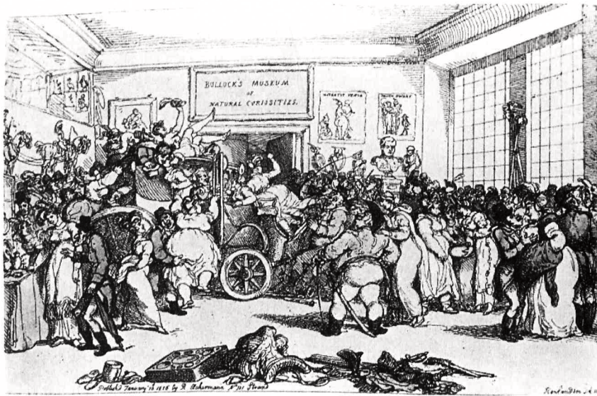
Figure 1.11 Bullock's Museum of Natural Curiosities