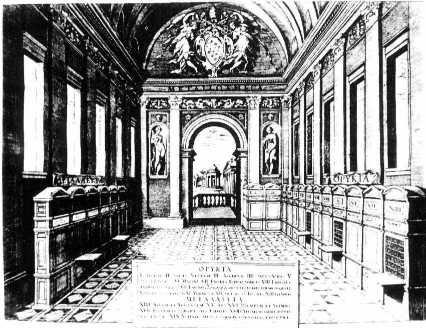
Figure 2.1 The cabinet of curiosities: the Metallotheca of Michele Mercati in the Vatican, 1719

power were withdrawn from the public gaze as punishment increasingly took the form of incarceration. No longer inscribed within a public dramaturgy of power, the body of the condemned comes to be caught up within an inward-looking web of power relations. Subjected to omnipresent forms of surveillance through which the message of power was carried directly to it so as to render it docile, the body no longer served as the surface on which, through the system of retaliatory marks inflicted on it in the name of the sovereign, the lessons of power were written for others to read: