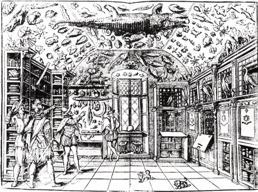
Figure 2.4 The cabinet of curiosities: Ferrante Imperato's museum in Naples, 1599

displayed in Paris and London. On her death in 1815, an autopsy revealed alleged peculiarities in her genitalia which, likened to those of the orang-utan, were cited as proof positive of the claim that black peoples were the product of a separate – and, of course, inferior, more primitive, and bestial – line of descent. No less an authority than Cuvier lent his support to this conception in circulating a report of Baartman's autopsy and presenting her genital organs – 'prepared in a way so as to allow one to see the nature of the labia' (Cuvier, cited in Gilman 1985a: 214–15) – to the French Academy which arranged for their display in the Musée d'Ethnographie de Paris (now the Musée de l'homme).