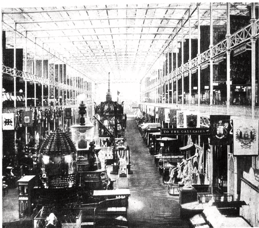
Figure 2.2 The Great Exhibition, 1851: the Western, or British, Nave, looking East

Foucault's primary concern, of course, is with the problem of order. He conceives the development of new forms of discipline and surveillance, as Jeffrey Minson puts it, as an 'attempt to reduce an ungovernable populace to a multiply differentiated population ', parts of 'an historical movement aimed at transforming highly disruptive economic conflicts and political forms of disorder into quasi-technical or moral problems for social administration'. These mechanisms assumed, Minson continues, 'that the key to the populace's social and political unruliness and also the means of combating it lies in the "opacity" of the populace to the forces of order' (Minson 1985: 24). The exhibitionary complex was also a response to the problem of order, but one which worked differently in seeking to transform that problem into one of culture – a question of winning hearts and minds as well as the disciplining and training of bodies. As such, its constituent institutions reversed the orientations of the disciplinary apparatuses in seeking to render the forces and principles of order visible to the populace – transformed, here,