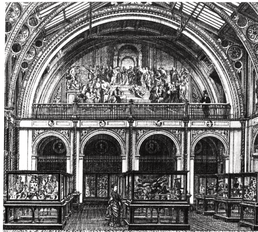
Figure 2.3 The South Kensington Museum (later Victoria and Albert): interior of the South Court, eastern portion, from the south, 1876 (drawing by John Watkins)

The South Kensington Museum thus marked a significant turning-point in the development of British museum policy in clearly enunciating the principles of the modern museum conceived as an instrument of public education. It provided the axis around which London's museum complex was to develop throughout the rest of the century and exerted a strong influence on the