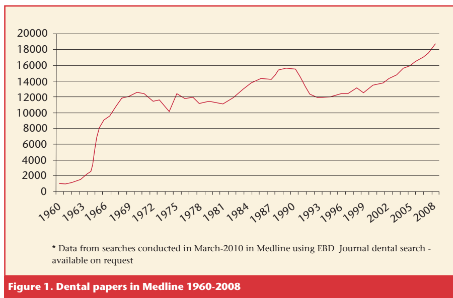
Figure 1. Dental papers in Medline 1960-2008

One of the first issues to address is whether the review's authors have clearly stated the question or questions they are trying to answer. The majority of systematic reviews address a narrowly focussed questions; for