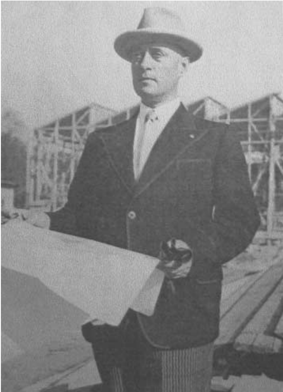
Figure 2. Armin Meili during the construction of the Swiss National Exhibition of 1939 in Zürich (source: H. Meili and T. Enzmann, Armin Meili. Homo universalis helveticus, einer Ausstellung . Luzern, Zurich: Katalog, 1983, p. 13).